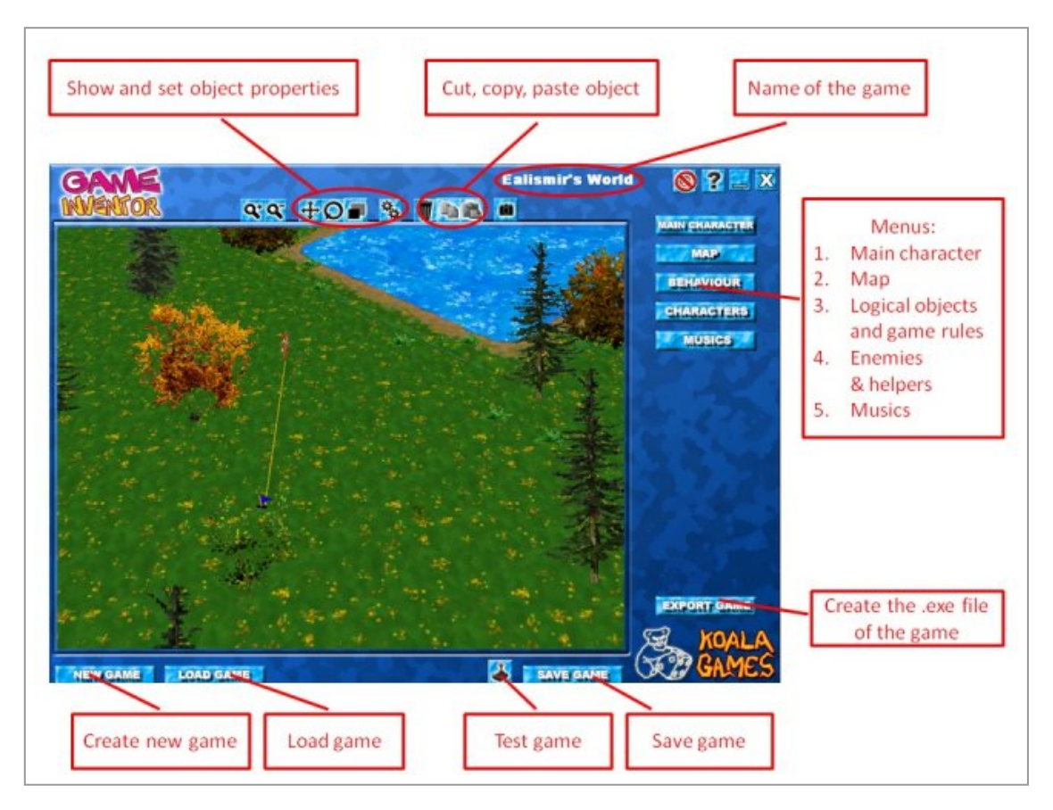
Figure 1 - Outlook of the Inventagiochi interface