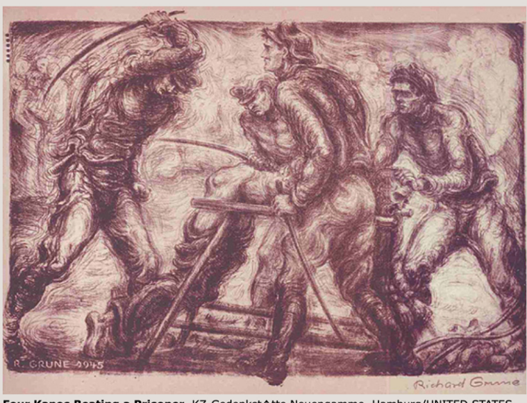
Figure 2: Screenshot of the presentation of a drawing by Richard Grune in the 2003 USHMM exhibition Nazi Persecution of Homosexuals, 1933–1945; https://www.ushmm.org/exhibition/ persecution-of-homosexuals/.