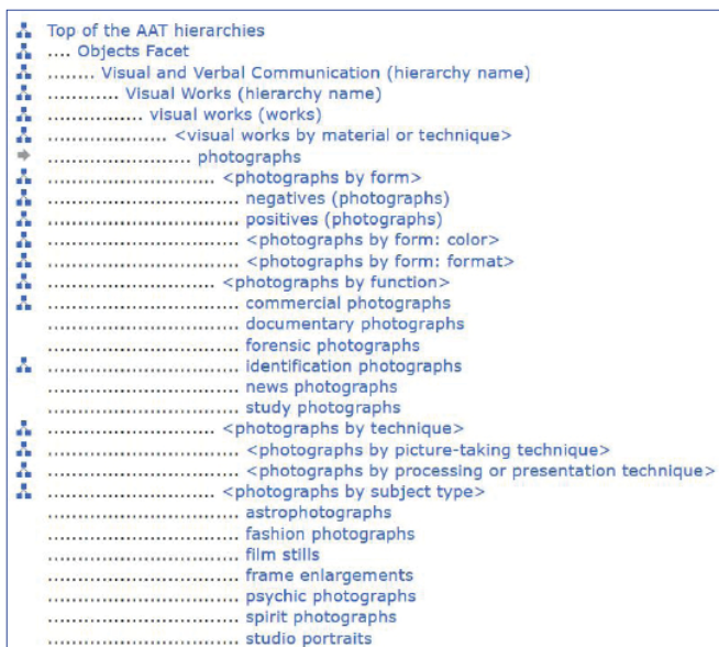
Fig. 3: Partial display of ‘photographs’ in the AAT Objects Facet (The J. Paul Getty Trust, 2004)

When arranging a large vocabulary, several levels exist for structuring its hierarchy: ‘facets’, ‘subfacets’ and ‘node labels’ are the technical terms which label them. Facets can be considered the major divisions of a controlled vocabulary, directly descending from the highest level of the hierarchical structure (‘root’) and grouping together concepts that share similar characteristics. Each facet may then have additional subdivisions, called ‘subfacets’. Finally, node labels or guide terms, which are usually represented by angled brackets, provide a further possibility to logically distinguish groups of sibling concepts sharing a common parent concept (Harpring, 2010, pp.142–144). Overall, the existence of these concept groups in structured KOS is most often meant to support the cataloguing of resources and provide useful features for navigating a conceptual network (Baker, et al., 2016, p.16). The illustration of the Art & Architecture Thesaurus (AAT) Object Facets and its following hierarchical levels (see Figure 3) can visually help to understand this modelling.