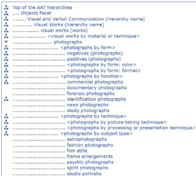
Fig. 3: Partial display of ‘photographs’ in the AAT Objects Facet (The J. Paul Getty Trust, 2004)

When arranging a large vocabulary, several levels exist for structuring its hierarchy: ‘facets’, ‘subfacets’ and ‘node labels’ are the technical terms which label them. Facets can be considered the major divisions of a controlled vocabulary, directly descending from the highest level of the hierarchical structure (‘root’) and grouping together concepts that share similar characteristics. Each facet may then have additional subdivisions, called ‘subfacets’. Finally, node labels or guide terms, which are usually represented by angled brackets, provide a further possibility to logically distinguish groups of sibling concepts sharing a common parent concept (Harpring, 2010, pp.142–144). Overall, the existence of these concept groups in structured KOS is most often meant to support the cataloguing of resources and provide useful features for navigating a conceptual network (Baker, et al., 2016, p.16). The illustration of the Art & Architecture Thesaurus (AAT) Object Facets and its following hierarchical levels (see Figure 3) can visually help to understand this modelling.