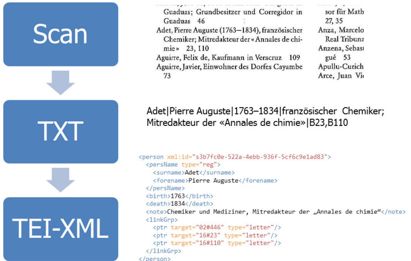
Figure 1. Schematic illustration of retro-digitization using the example of a person entry.

36 The research data collected in these volumes is now available for the first time as TEI-XML compliant data sets. It has been editorially revised, linked and enriched with IDs from authority files (GND and VIAF) and geo-referenced data (GeoNames) for connection to external resources (e.g. other digital scholarly editions, Neue Deutsche Biographie, Wikipedia etc.). If an entry in the index of persons is provided with a GND-ID, not only the ID is used to link external offers. The GND data record is also retrieved and stored as an additional information layer in the edition humboldt digital . The dataset provides, among other things, family and other relations to a person. This enables automated links to index entries of relatives, e.g. father or wife, in a person entry (see fig. 2). Of course, data records in the GND can be incomplete or erroneous, but this work could only have been done manually with (too) much effort. Currently, more than 10,000 entries on people (fig. 2), places, and institutions related to Humboldt are available online. 17